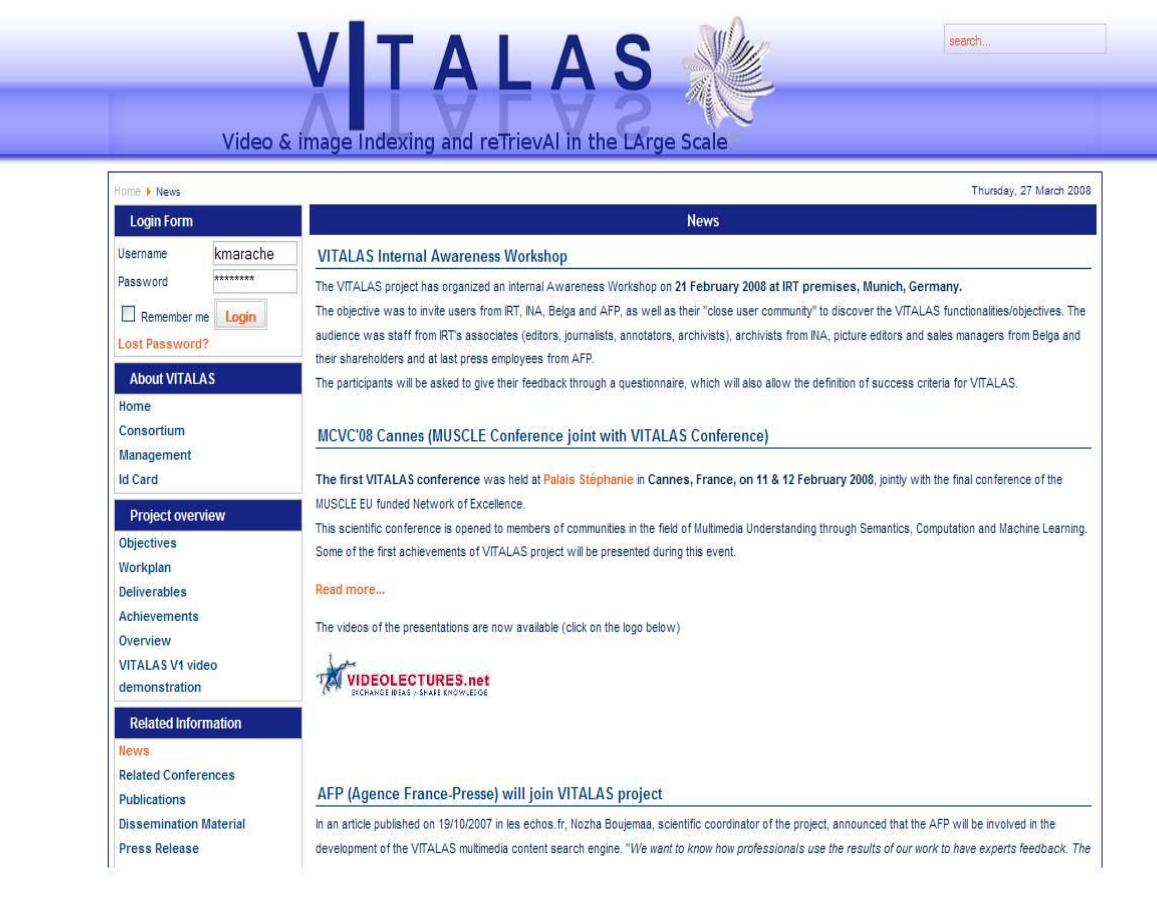
VITALAS home page: http://vitalas.ercim.org

The first link is a video of VITALAS prototype V1, presented to the European Commission during the first review meeting in March 2008.